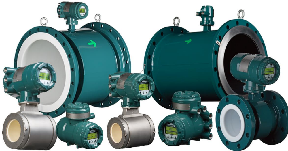
1 – Magnet Flow Tubes can measure high volume flow rates on large and small diameter piping.