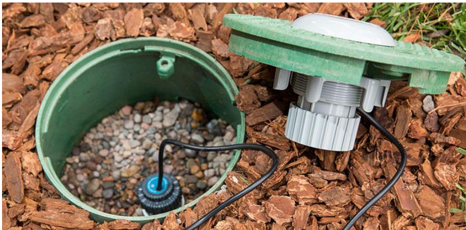
2 - Wireless Flow Sensor from Hunter